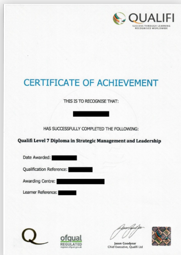
QUALIFI Level 7 Certificate QUALIFI 七級證書