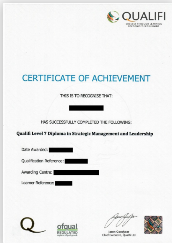
QUALIFI Level 7 Certificate QUALIFI 七級證書